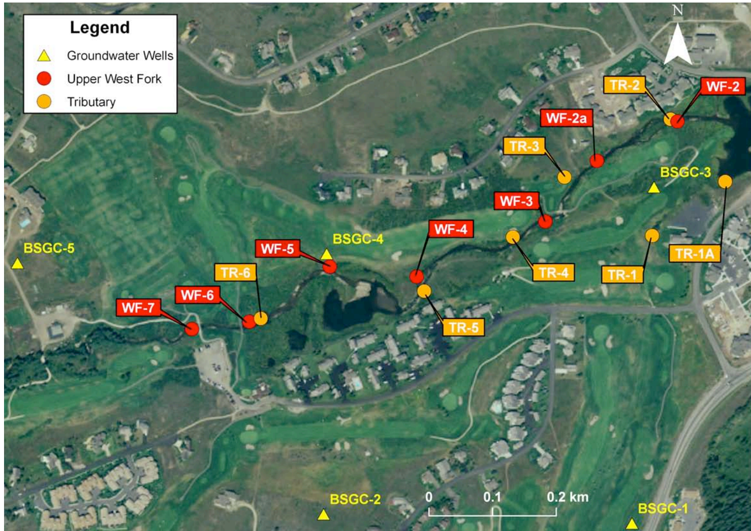
Figure 2-2: Proposed monitoring sites on the Big Sky Golf Course.